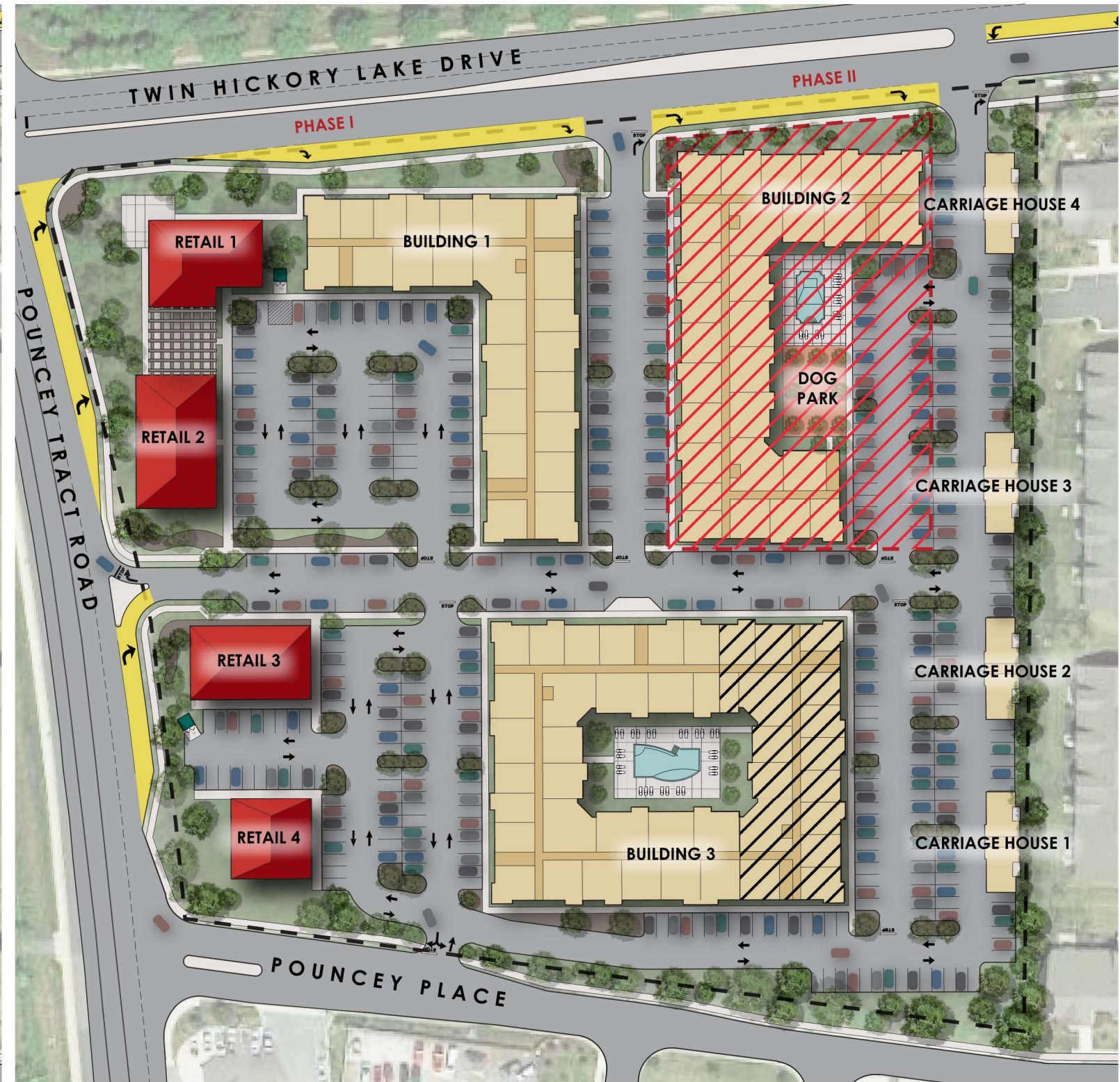
1 Site Plan - Ground Level Scale: 1" = 100'-0" Plan